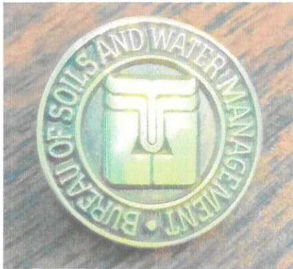
Pin, silver (15 years in service)