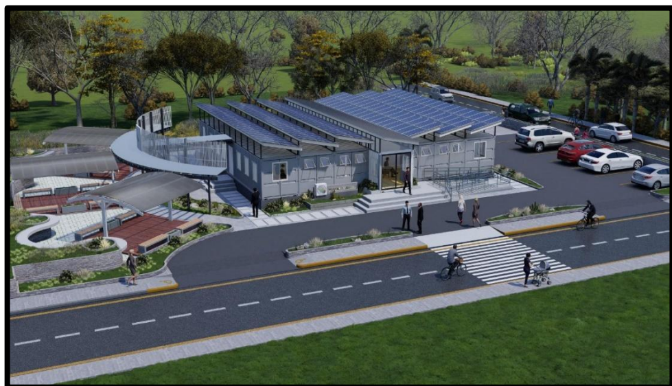
Figure 1: Typical Design of Provincial Soil Laboratory