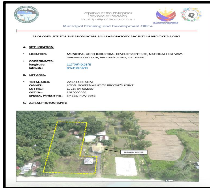
Figure 2 : Sample Preliminary Survey and Mapping information

Preliminary survey and mapping conducted at the proposed site for the PSL (lot area varies), capturing key land details including geographic coordinates, land title information, and total land area. The activity aims to assess the suitability of the location for laboratory construction and operation. Aerial imagery, as shown in Figure 2, provides a clear view of the terrain and site boundaries, supporting data validation and planning for infrastructure development. Available preliminary survey and mapping documents of all identified sites shall form part of the reference materials for this requirement.